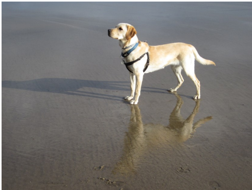
Me on the beach at Westward Ho!

the heavy things for the minimum time. I had a wonderful time exploring odd areas and finding exotic things to eat. We retired relatively early and the mean humans woke me from my beauty sleep for a walk and breakfast before driving back down to Core Copse. (It was especially galling as the humans had been offered accommodation in the area!) I helped Susan put out boxes on 10 controls, then put out the start and finish controls before putting out some funny faces on the white and yellow courses. We then went back to the car and thence to the assembly field to meet all my friends. I wanted to go out and explore some more, but my people were boring and wanted a rest. Later we went to collect some of the controls; this meant that I managed to visit all the controls except one (no. 42) over the weekend. It was lovely as I was able to meet other dogs and Robin Carter as well as finding some unusual food (a tee shirt which had to go down in one as I was unable to tear it up!). I did feel that they should have put at least one more control on the white and yellow run in after their final control!