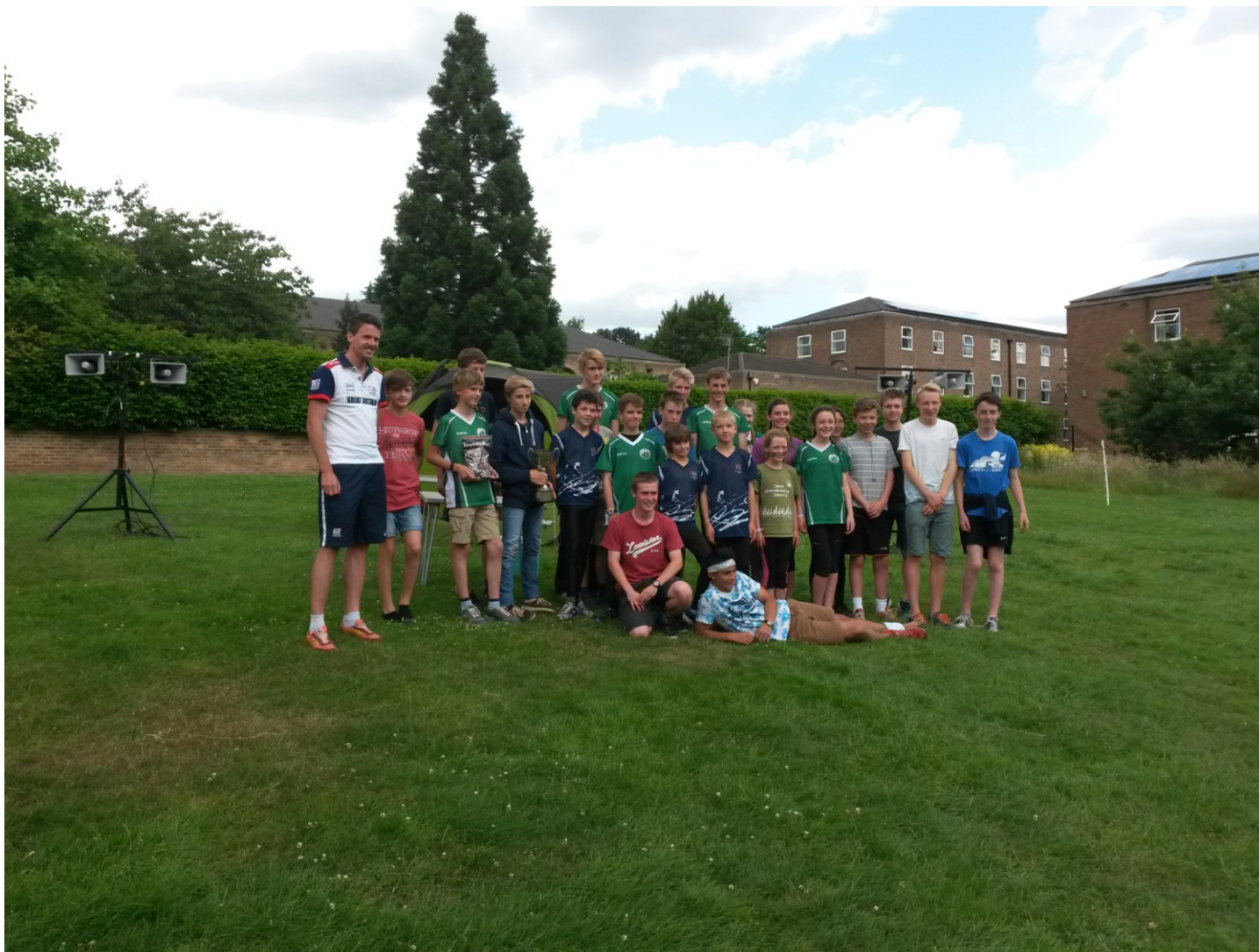
The Devon Members at the Yvette Baker Trophy Final