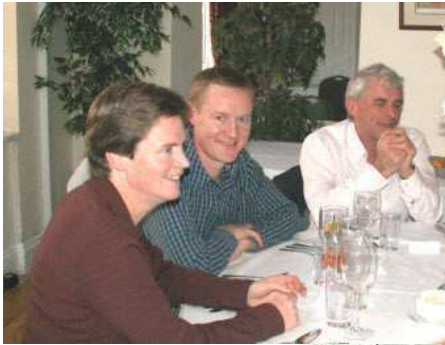
Scenes at the 30th anniversary dinner