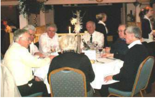
Scenes at the 30th anniversary dinner