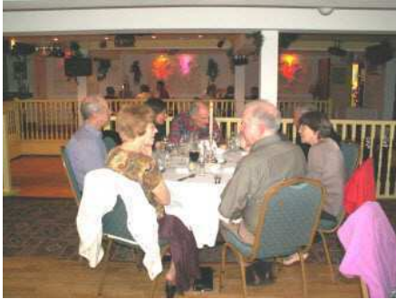
Scenes at the 30th anniversary dinner