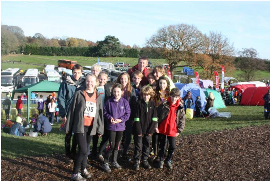
The East Devon Bunch at the British Schools Championship