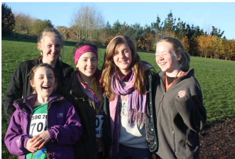
East Devon Girls at the British Schools Championships

Two weekends before was the British Schools Orienteering Championships at Delamere Forest in Cheshire. The drive up took us almost 5 hours, but we managed to entertain ourselves. Teams from King's, Colyton, Woodroffe and Clyst Hydon Schools took part so our area of East Devon was well represented. The weather was very cold, but dry thankfully considering the rain we had that week. My course was a yellow, but seemed very technical, with lots of contours and heavily wooded areas but I rose to the challenge and did better than I had hoped. After, I went on an orange with a few others. We didn't finish in an amazing position but it was great to see what it would have been like. We had some brilliant positions - 6th and 11th.